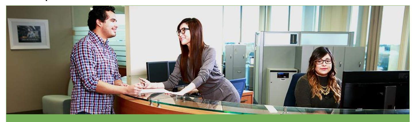
Goal 3: Provide improved services to apprentices and employer sponsors.